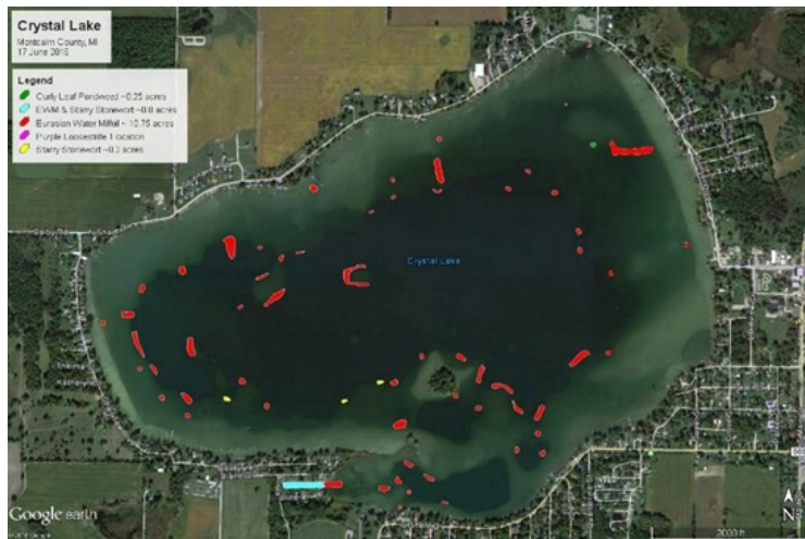
Pretreatment Scan June 2016

which would affect our lake in the future. These tests are part of the Cooperative Lake Monitoring Program, a