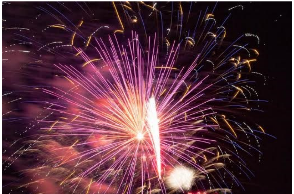
In spite of a shell which misfired during the show damaging some of the remaining fireworks the grand finale was truly spectacular.