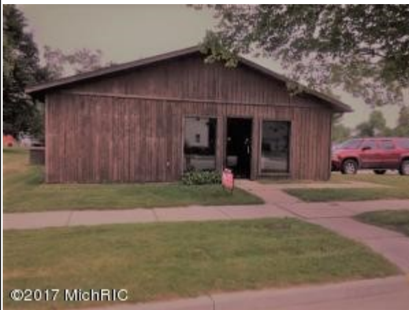
319 S Main Street Crystal, MI 48818 Active / 17030925 $56,000

This allows me to be available to give my customers the best possible personal service.