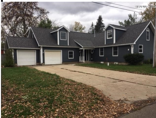
$235,000 415 W Lakeview Street Crystal, MI 48818 Active / 17055028