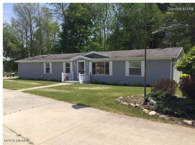
$139,000 11688 W Monroe Riverdale, MI 48877 Active / 18010270