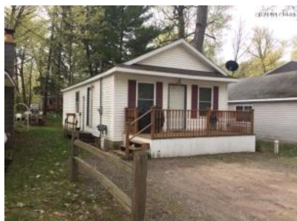
114 St Johns Crystal, MI 48818 Active / 17018998 $62,900