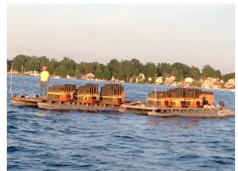
Special thanks to the Montcalm County Sheriff and the Marine Patrol for their help.