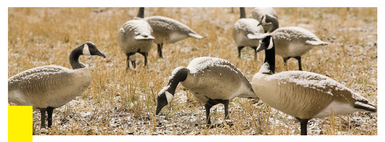
Goose Maintenance Update - Summer 2024