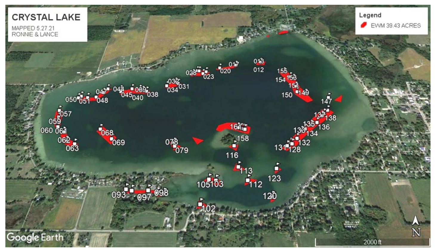
Aerial map of Crystal Lake showing locations of invasive Eurasian Water Milfoil found on 5/27/2021

Hopefully we have the Eurasian milfoil under control, and you won't see it but PLEASE remember that milfoil can stick to boats and trailers and then re-root. BEFORE putting your boat in the water, remove any visible plant matter from the boat and trailer and drain and dry livewells and bilges to kill any other possible aquatic hitchhikers.